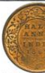
The legend within a wreath surrounded by a wreath. All surrounded by a raised, toothed rim.