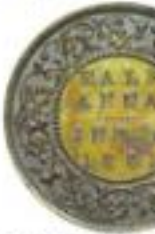
The legend within a wreath surrounded by a wreath. All surrounded by a raised, toothed rim